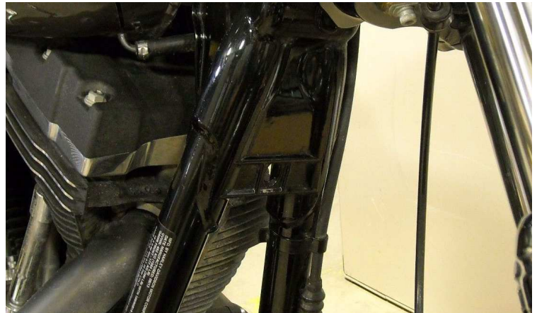
Figure 2. Dyna